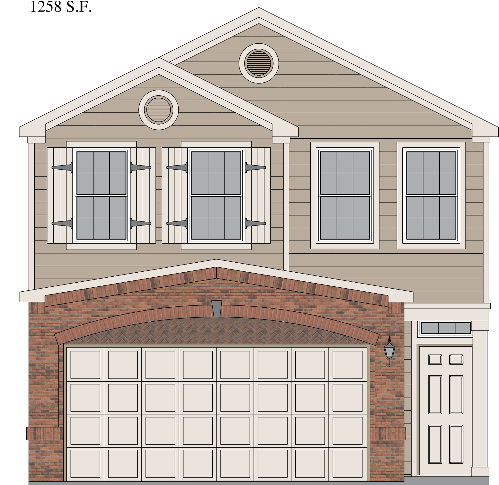
FRONT ELEVATION B

TOTAL AREA 2079 S.F. 24'-0"W. X 58'-0"D. PLAN 2079